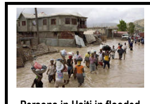
Persons in Haiti in flooded areas following storms.