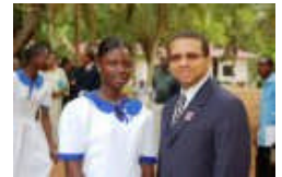
Youth enrolled at Lott Carey Mission School in Liberia. The Mission School celebrates its 100th Anniversary in April 2009.